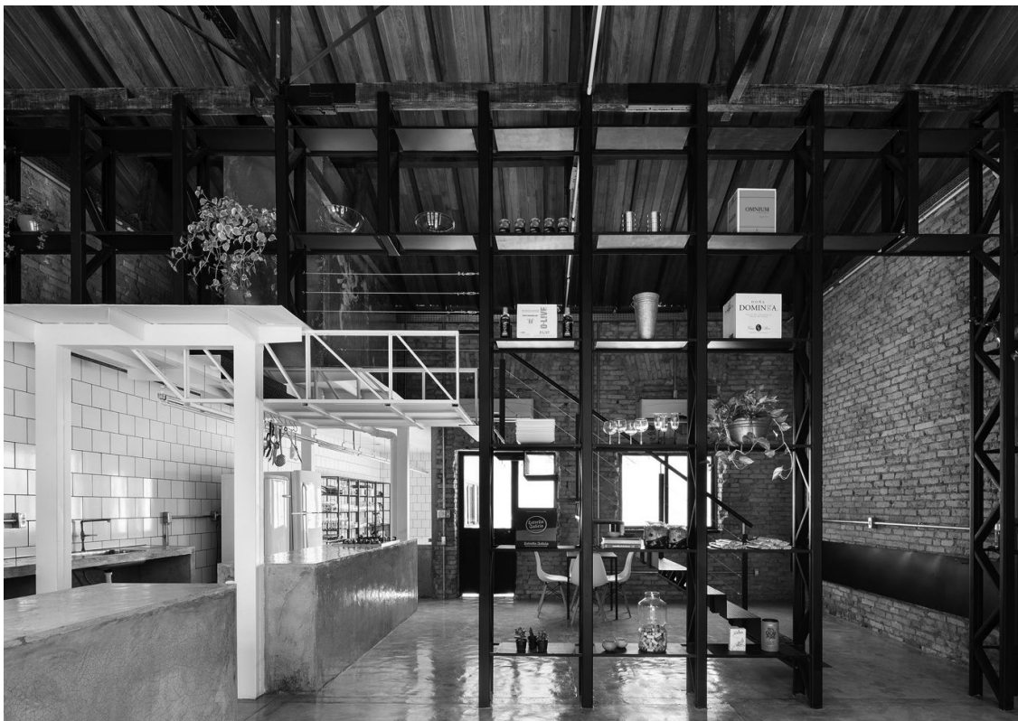
Figure 2. Interior view 1. Reverbo/Gabriel Castro.