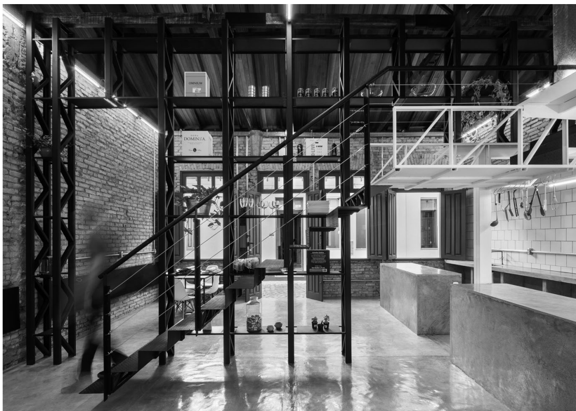
Figure 3. Interior view 2. Reverbo/Gabriel Castro.